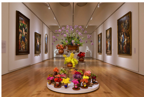
NC Museum of Art, Art in Bloom

The quilts should be 96" or smaller in perimeter and should be bound with black or gold fabric provided by the Guild. The quilt will be hung at the show and should have a sleeve on the back.